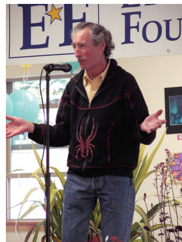
Cisco: "Honest, I wouldn't lie to ya. OOOOLALA! They're everywhere!"